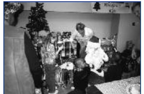
Santa visits a shelter

something your family, business, group, etc. can do. Many times volunteers have told us afterward that doing