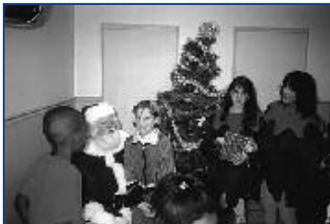
Thanks for coming Santa

Atlanta. All School Box stores, Post Properties leasing offices will be serving as collection sites for the public to drop