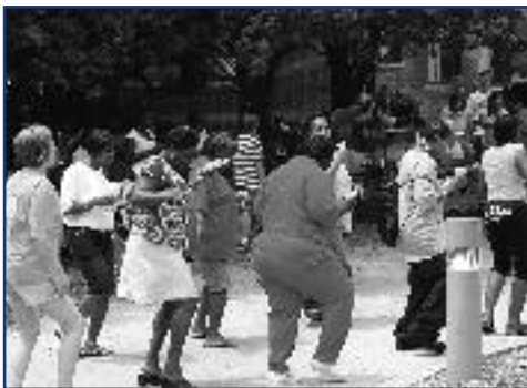
Working up an appetite

partly cloudy kind of day that kept the temperatures pretty mild for early August. And as always, at the end of the day, the kids were handed brand new book bags filled with all necessary school supplies. The smiles and "All rights!!!" when they chose their bags were proof that the kids were excited about their new belongings.