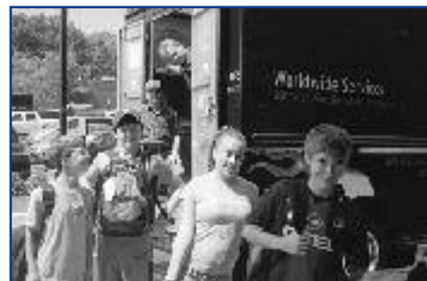
Thanks for all your help UPS

Of course this didn't just all fall into place. WSB-TV's Family 2 Family Partners were all heavily involved in making this happen. We were thrilled that Kroger Supermarkets agreed to be a drop off point for the public to drop off their donations of book bags and school supplies. WSB did a great job of promoting the campaign, and as always Northside Hospital had an absolutely amazing collection. Many other companies, including Bank of America, Siemens and iHealth Technologies also did collections and the overall results were awesome: 3,315 new book bags and all the supplies needed to fill them. The Friday and Saturday before the event we brought all the supplies and bags to a central collection and literally hundreds of volunteers helped us sort supplies and then stuff the book bags.